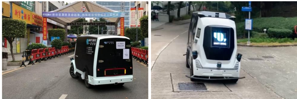
Fig 1. Test of the autonomous vehicle in Shenzhen, China, (left) and The Hong Kong University of Science and Technology (HKUST) (right)

The autonomous vehicle is composed of hardware and software systems including sensors, cloud server modules and algorithms to achieve autonomous navigation with a dynamics-based Model Predictive Controller (MPC)